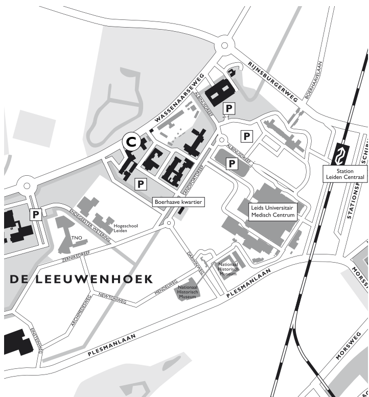
C Clusius Laboratory (Biology)